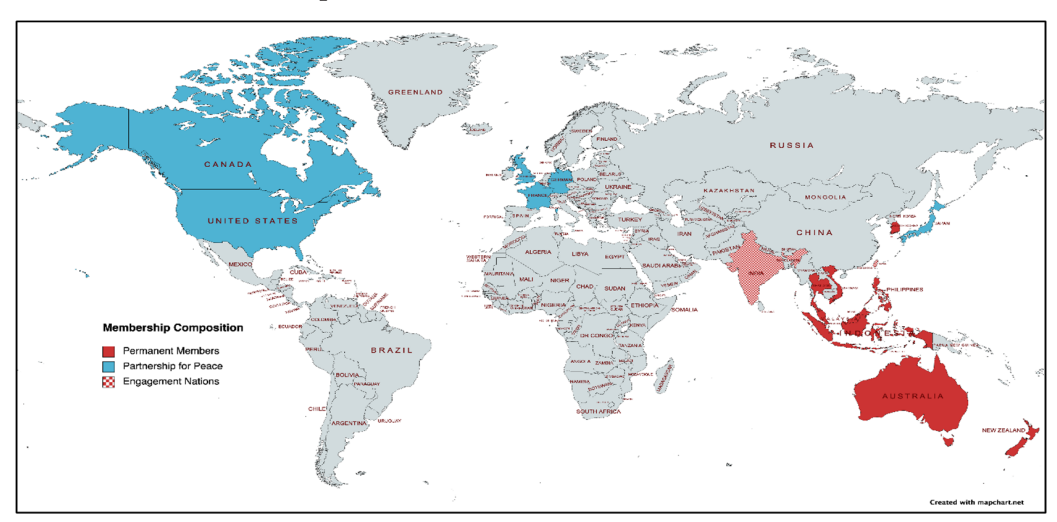
Figure 1. Notional member nations of a future "Asian" NATO

Although in this paper, the term NATO is used, it is only for comparison purposes. There is no intention for countering China in the Pacific to become a mission set under the current NATO charter. NATO does not have the capacity, desire, or goal of committing to operations in Asia. For this organization to be credible, it will have to comprise and be led by the countries in the Indo-Pacific region. Figure 1 depicts a proposed inaugural structure of this organization. The critical aspect to the success of a defense-focused organization in the area will be its membership composition. One consideration for the arrangement, since the intent for this organization is to deter China, is that it cannot be an allencompassing organization similar to the European Union. Only countries at risk or potentially at risk from China should be members and inflammatory countries or nations with unclear political status should become associate members.