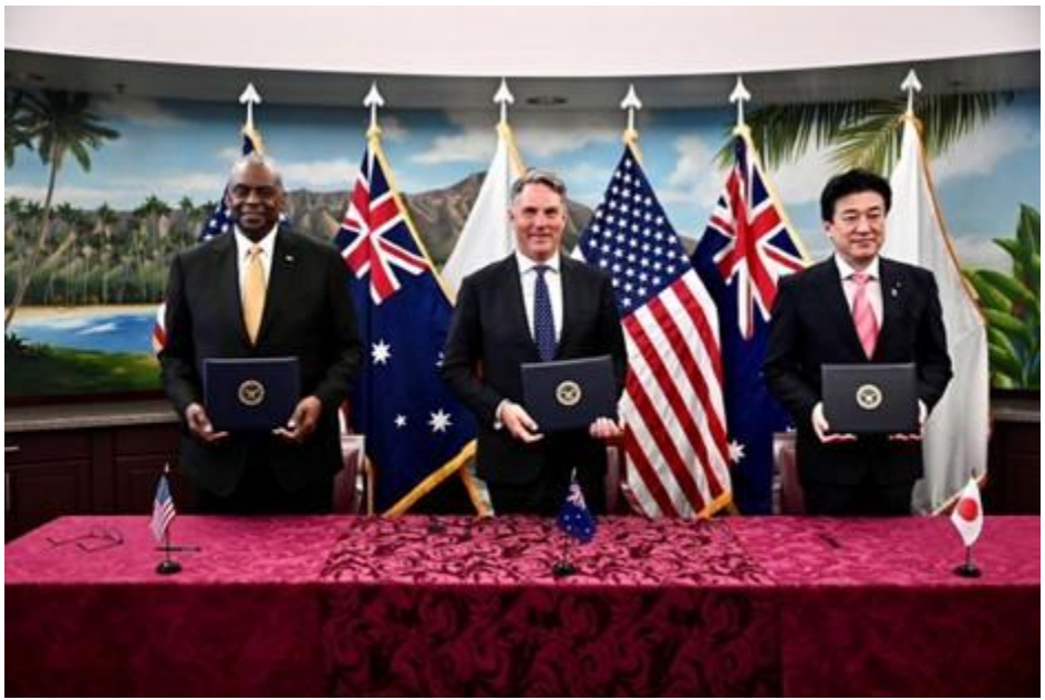
Figure 1: U.S. Defense Secretary Austin, Australian Defense Minister Richard Marles, and Japanese Minister of Defense Kihara Minoru in Hawaii