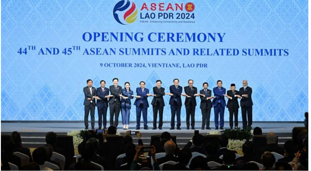
Figure 1: ASEAN Leaders at the opening ceremony of summit / IMAGE/