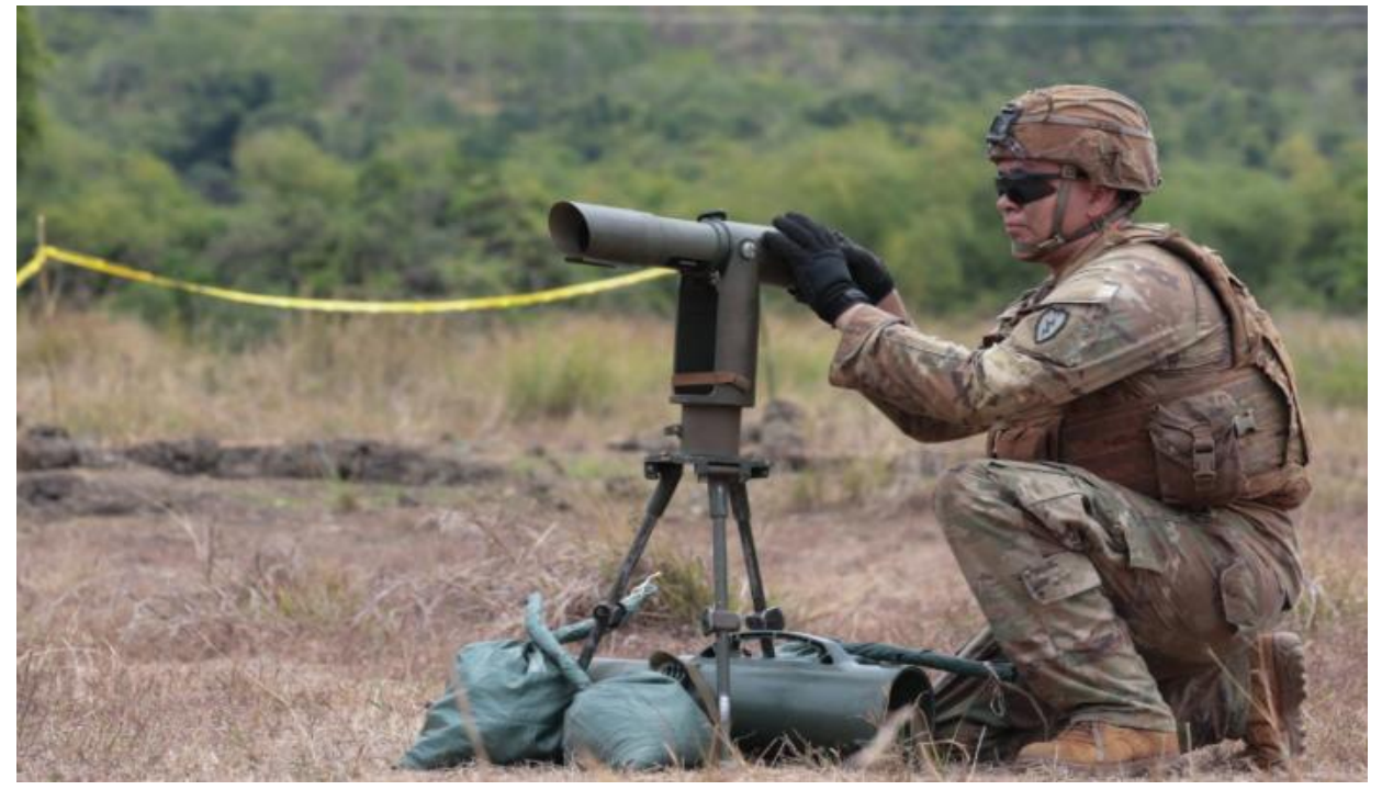
Figure 1: Soldier of the Philippine Army's and U.S. Army conduct live-fire training during Salaknib 2025, April 01, 2025.